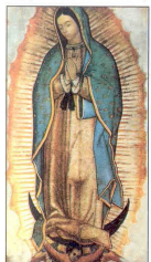
Pray for Unborn Human Life

Holy Hour for Life on Sunday, September 25th from 7-8pm. Life Chain—Sunday, October 2nd from 2-3pm on 41st St.